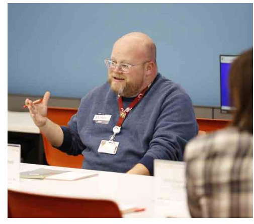
Pictured: Community members participate in The Big Table, an annual day of community-focused conversations and civic engagement.